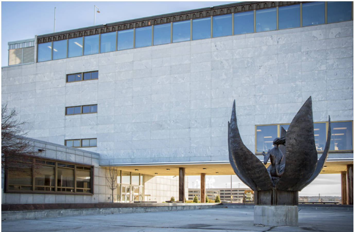
Veterans Service Building and Promise of Youth, November 2016.