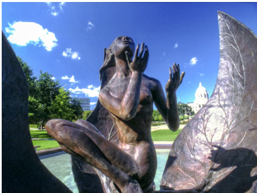
Promise of Youth, 2000.