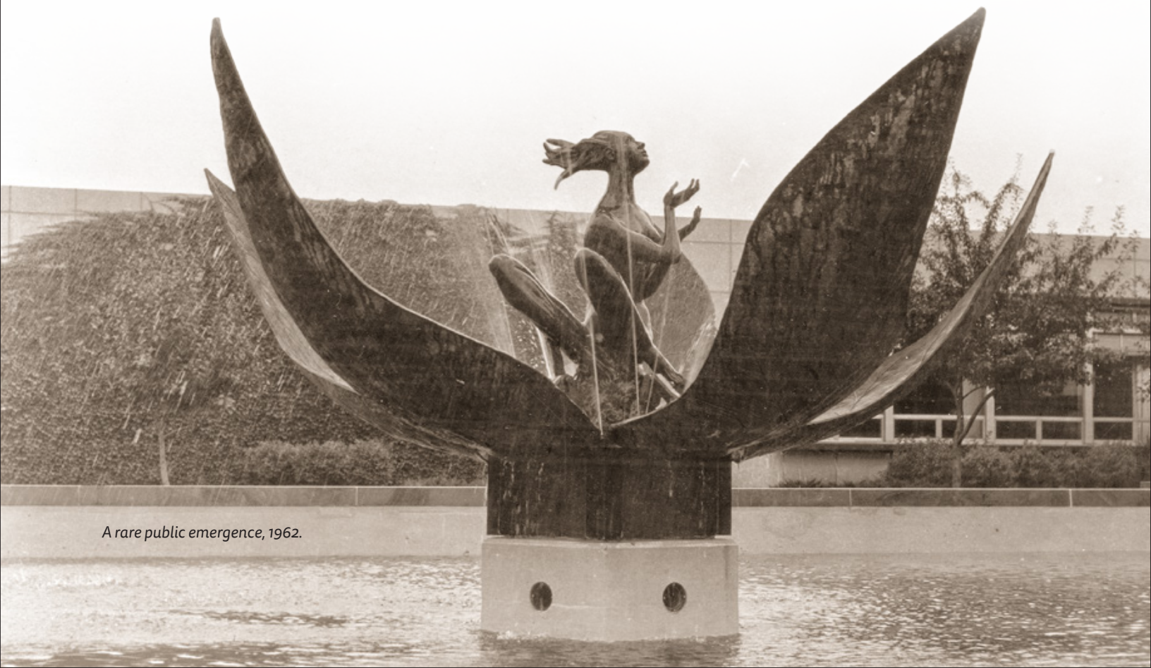
A rare public emergence, 1962.

Finally, a 1998 project championed by DFL senator Steven Morse to clean and restore public art on the State Capitol Mall allotted $262,000 for the statue and fountain. The Minnesota