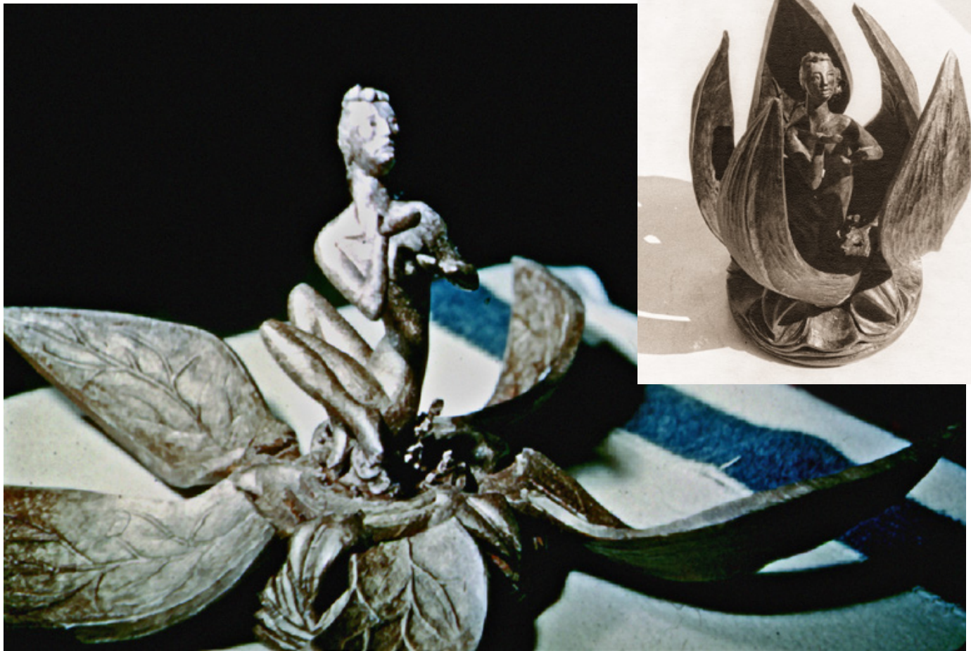
Early models of the Promise of Youth sculpture with lotus petals open and closed (inset).

The artist’s innovative concept for the sculpture featured mechanically operated lotus petals that opened at dawn, via a timer mechanism, to reveal a female nude with uplifted arms. At dusk, the petals would close.