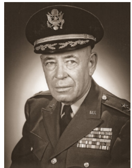
National Guard Major General Ellard A. Walsh, about 1950.

By the next VSBC art subcommittee meeting, commissioners variously expressed revulsion, were concerned that Minnesota citizens would disapprove of the figure, or withheld